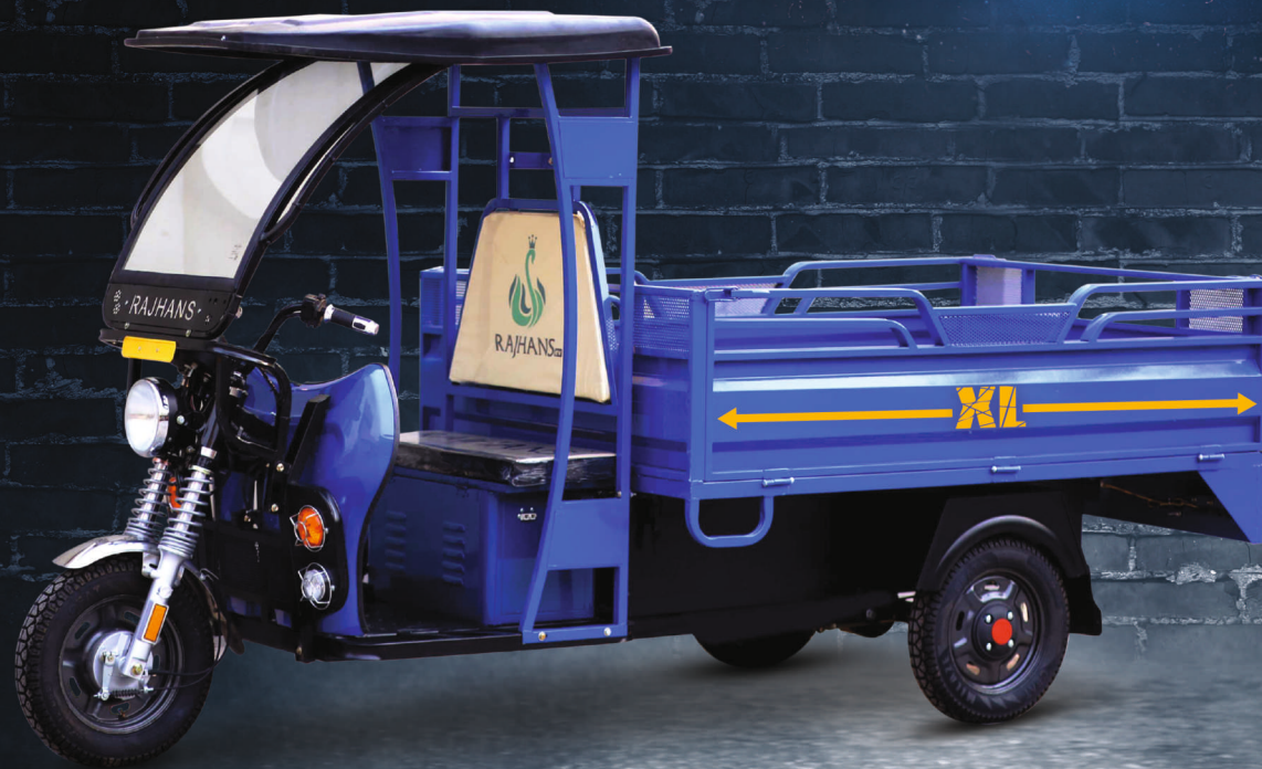
RAJHANS CARGO XL